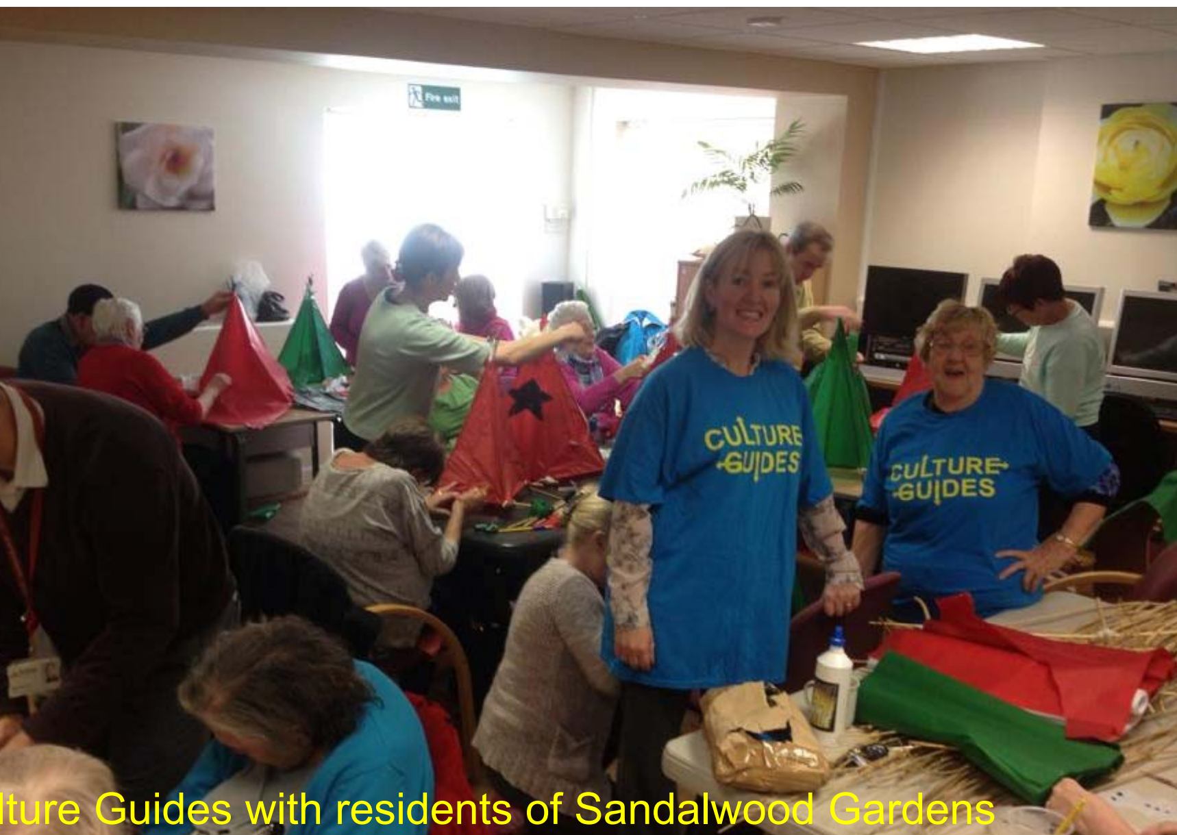
Culture Guides with residents of Sandalwood Gardens