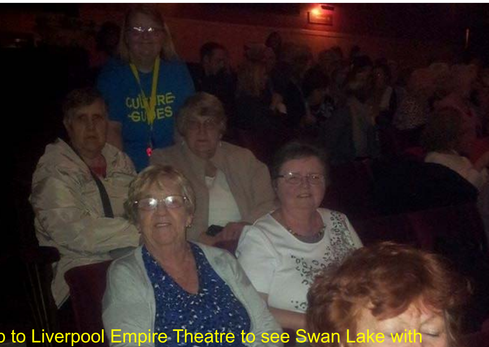
to Liverpool Empire Theatre to see Swan Lake with